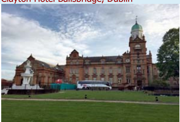
Clayton Hotel Ballsbridge, Dublin

This first class hotel is a short walk away from the RDS Main Arena.